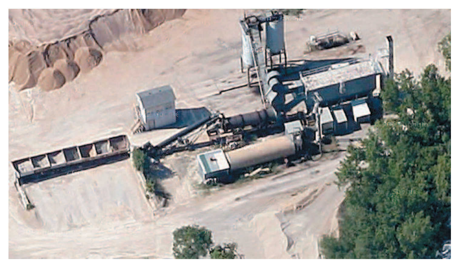
Asphalt Plant located at 936 Appleton Road • Menasha, WI 54952